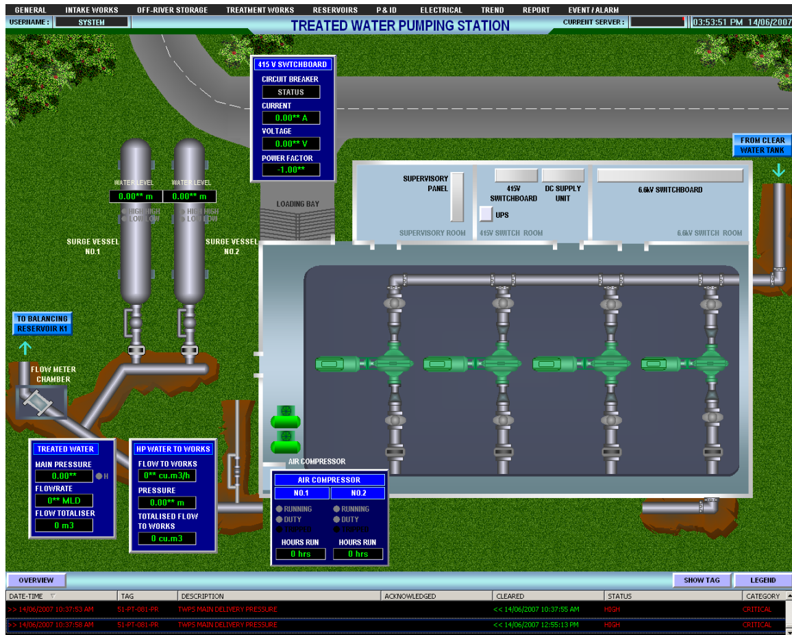
Fig. 2. Treated water pumping station layout.

On 14/06/2007- The last process plant's LCP FAT – Treated water pumping station has been completed.