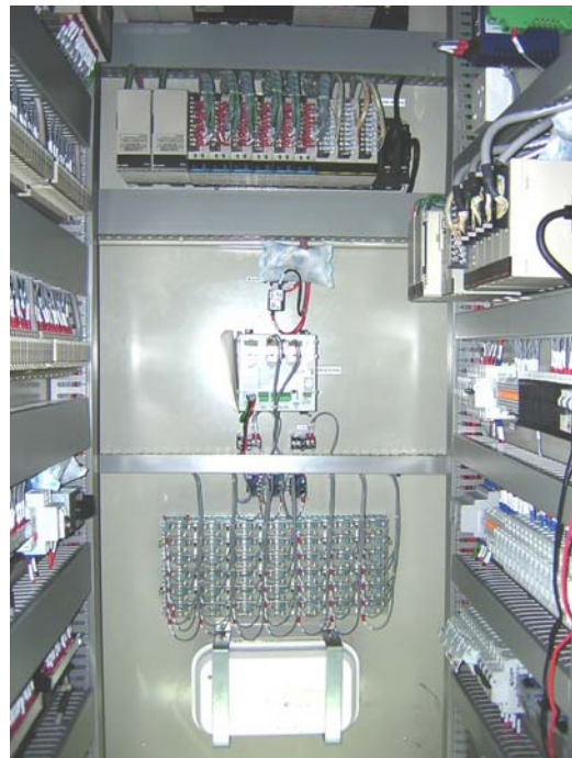
Fig 3: Panel Images